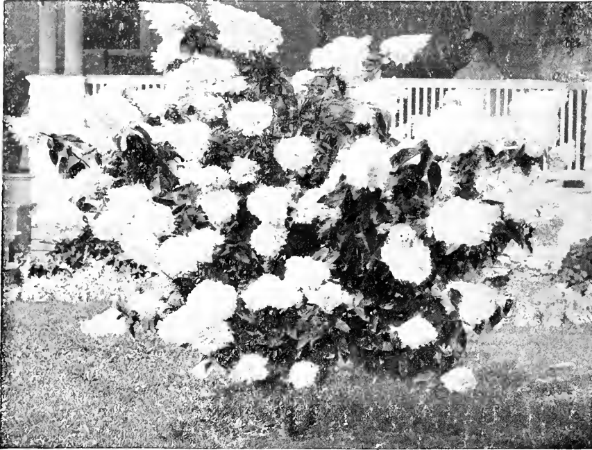
HYDRANGEA P. G.